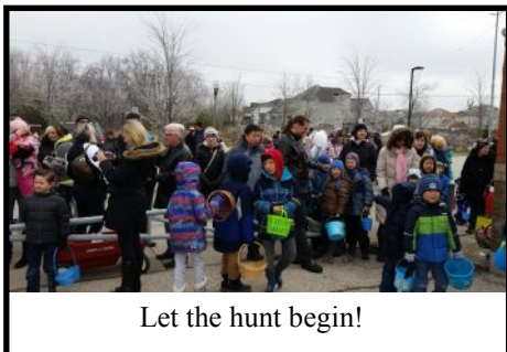
Let the hunt begin!