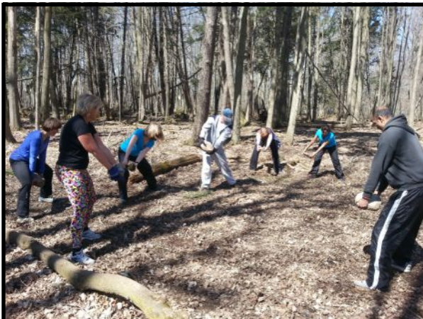
The group swinging rocks at Laurelwood Park

I purposefully design my fitness programs so that we use the natural features in our neighbourhood to improve our strength, mobility, balance, endurance, and agility, all the while enjoying the soothing benefits of nature. We have two groups that train in Laurelwood Park (Gatestone Park) on Saturdays at 11am and Mondays at 9:30am.