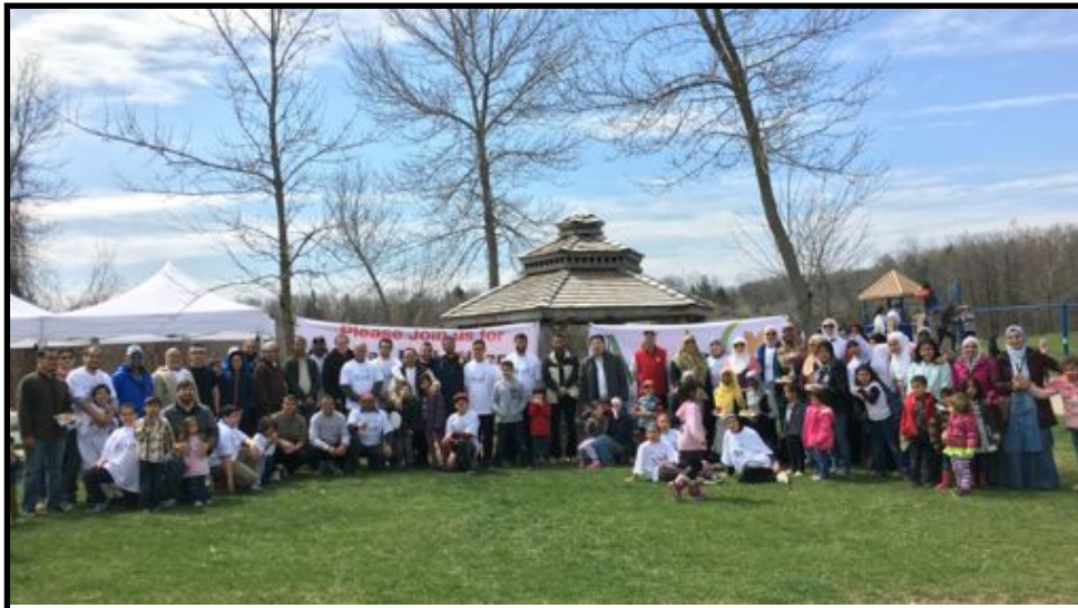
Volunteers from MAC Give pose for a picture after the clean-up at Old Oak Park

As part of Earth Week events, many Laurelwood residents pitched in to clean up unsightly litter from their local streets, parks and area trails. All residents are encouraged to consider every week an Earth Week and to make Laurelwood a litter-free zone throughout the entire year!